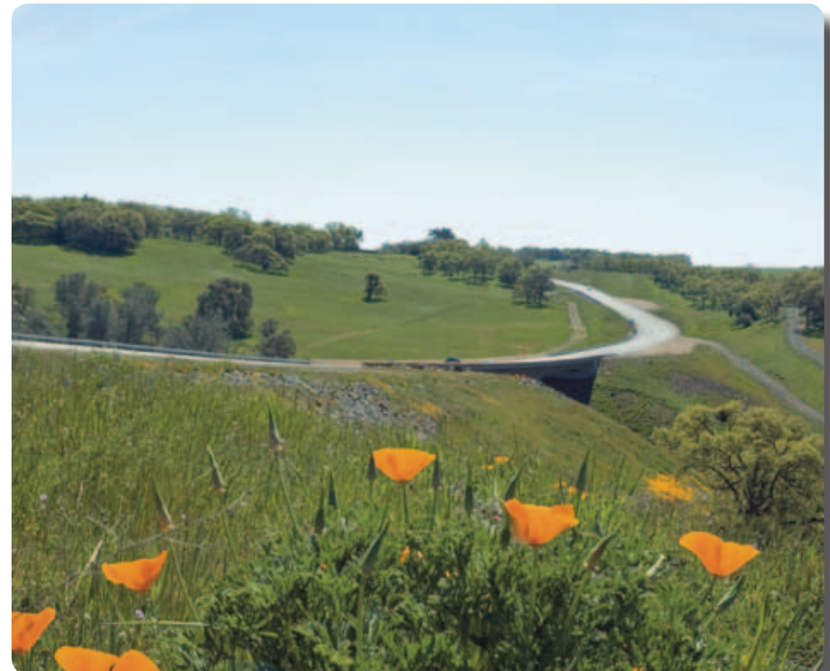
Sutter Creek Bypass