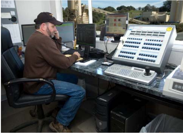
ALKON Tracking and Computerized Batching