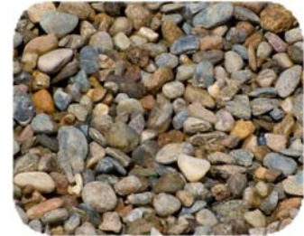
TABLE MOUNTAIN BLACK AGGREGATE